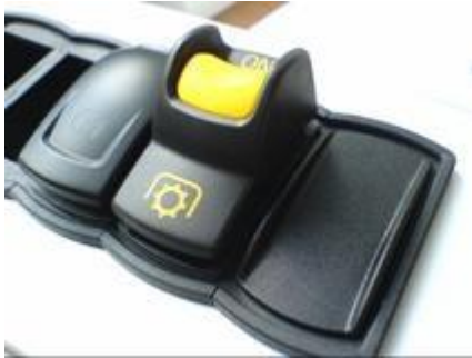
New KR locking rocker