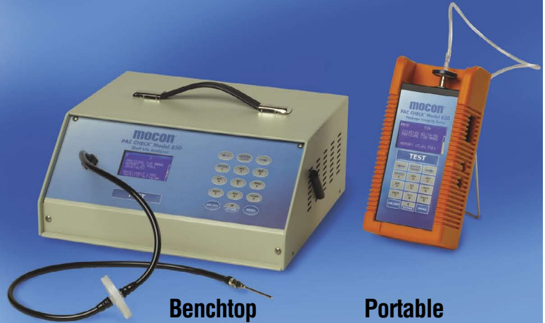
Benchtop MODEL 840

Patent pending AccuLeak™ technology determines the absolute leak size of your package