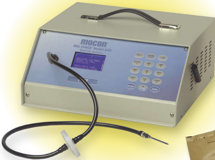
Benchtop PAC CHECK® MODEL 840

For use as a research & development tool in package shelf-life studies as well as a quality control device for the measurement of important headspace and leak parameters.