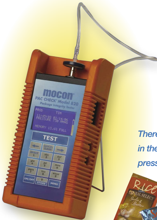
Portable PAC CHECK® MODEL 820