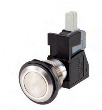
C0911VA - - -