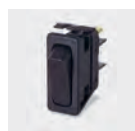
☐ C6000AL - - -