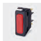
☐ C6030AL - - -