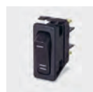
☐ C6010AL - - -