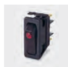
☐ C6003PL - - -