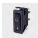
☐ C6000AL - - -