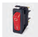
☐ C6003AL - - -