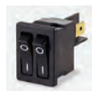
☐ H8800V/H8800VA ☐ T8800V/T8800VA