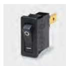
☐ X8800VA ☐ T8800VA - - -