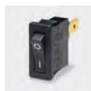
☐ X8800VA ☐ T8800VA - - -