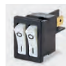
☐ H8800V/H8800VA ☐ T8800V/T8800VA