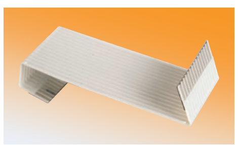
Folding, bending and creasing options