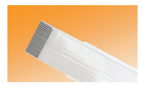
Parlex custom length cables offer multiple spacing, wide range of conductor counts, and a variety of termination and locking options