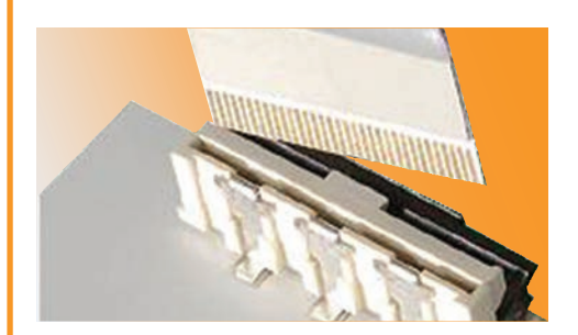
Ease of assembly