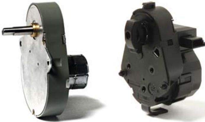
Actuators from Saia-Burgess

With unparalleled expertise in developing complete actuator systems, we are #1 in automotive HVAC actuators and headlamp adjusters, providing customers with the flexibility of simple to complex positioning, direct or bus controlled, and fast response with maximum reliability products. Other products include interior lighting switch systems, doorlock latches, gear shifter, brake transmission shift interlock, accelerator pedal box systems, ABS switching system, etc..