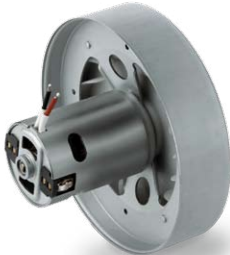
Vaccum Cleaner Motor