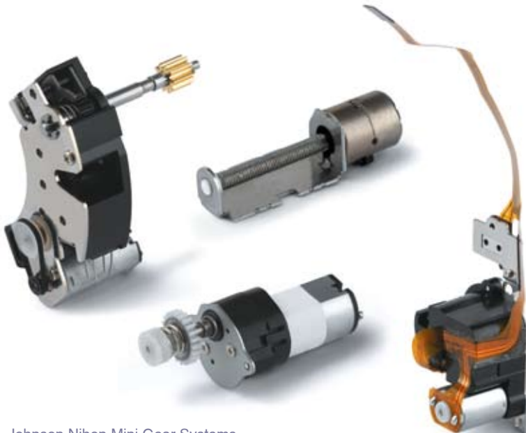
Johnson Nihon Mini Gear Systems

Our precision motion expertise in DC motor plus excellence in precision plastics and gears, have enabled us to provide innovative gear systems used in applications such as camera focus and zoom systems, power curtains and toilet seat systems, etc..