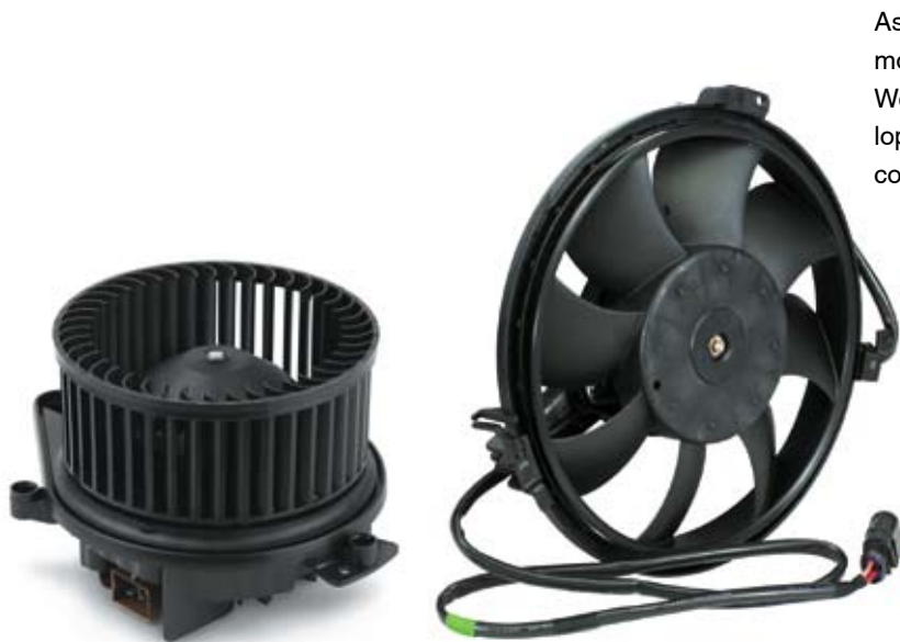
Cooling Fan Modules from Johnson Gate

As the #1 manufacturer of automotive cooling fan modules, we are experts in fan and motor technology. We work collaboratively with our customers to develop cooling fan modules, HVAC blowers and speed controllers that are customized to their requirements.