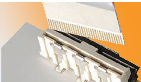
Ease of assembly