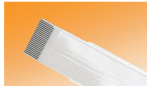
Parlex custom length cables offer multiple spacing, wide range of conductor counts, and a variety of termination and locking options